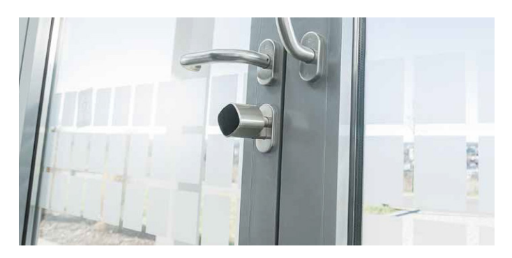
Compact cylinder – electronic module in the internal knob.

The surface fixed version has an impressively elegant design. It is the ideal solution for fire doors or emergency exit doors. The mechatronic cylinder can be used wherever electronic access control is required, because no changes need to be made to the door. In this version, the robust metal housing is simply secured to the inside of the door on the cylinder. You can choose between the mechatronic cylinder with thumbturn or double cylinder. The battery is integrated into the housing. When changing the battery, you can easily open the plastic cover using the multitool and replace the battery