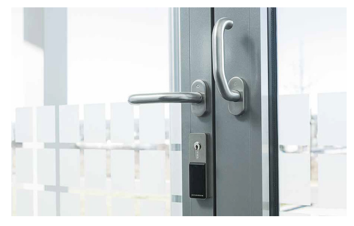
Surface fixed version – electronic module on the inside of the door.